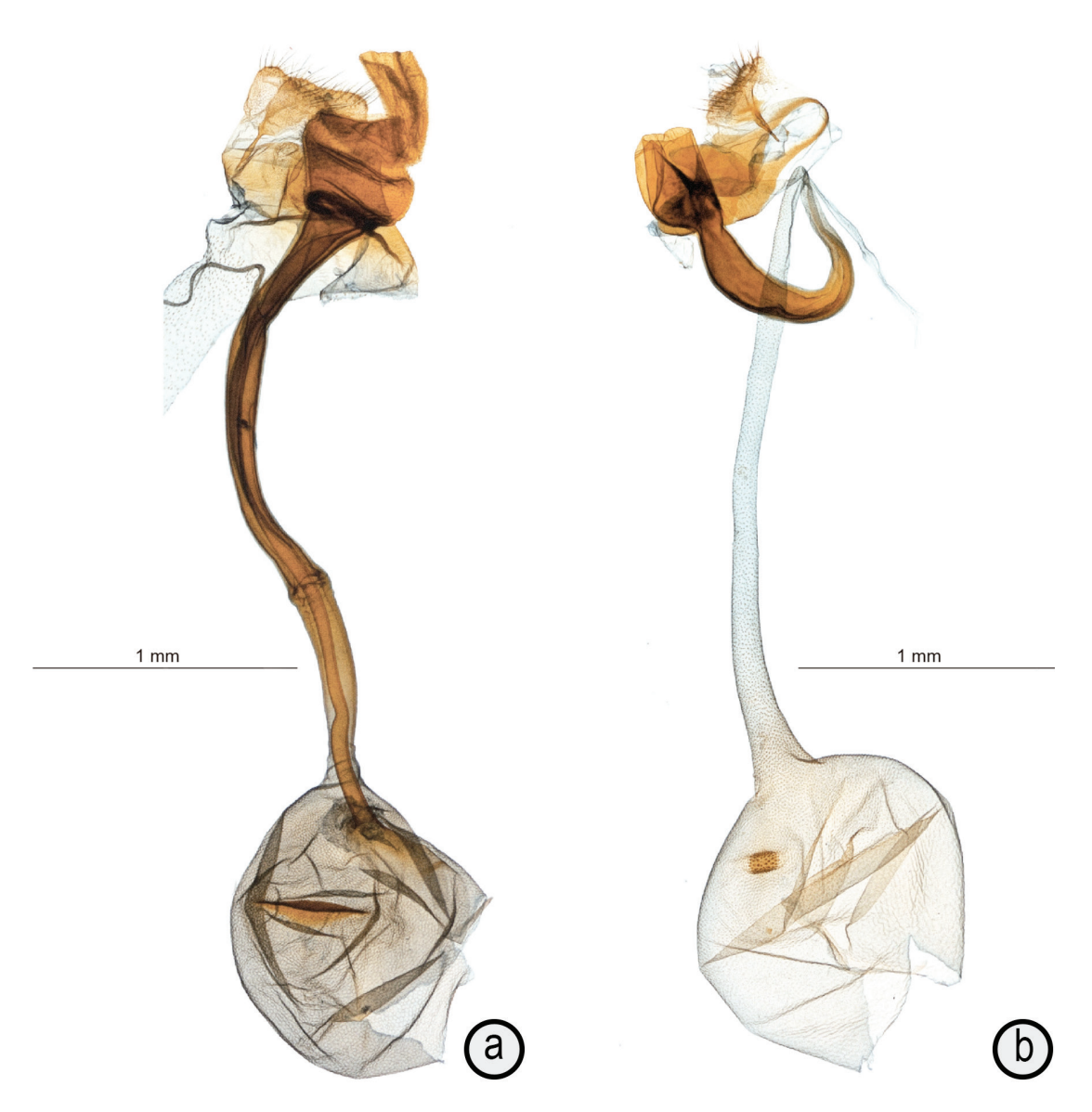
Figure 3. Female genitalia of Microcrambus species. A) Microcrambus arevaloi paratype, with tubular section of spermatophore left inside ductus bursae, slide MHNG-ENTO- 84603; b) Microcrambus leticiensis paratype, slide MHNG-ENTO-84602.

<u>Conflict of interests</u>: The manuscript was prepared and revised by both authors who declare the absence of any conflict which could put the validity of the presented results at risk.